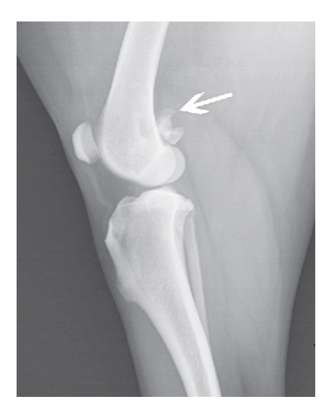
Figure 1 Mediolateral radiograph of the stifle of dog number 6. Note the moderate, mildly irregular, but smooth new bone formations surrounding the lateral fabella (arrow).

Descriptive statistics were performed for signalment (age, weight, sex, and breed), duration of lameness, affected side, initial trauma, clinical and imaging findings, therapy, and outcome.