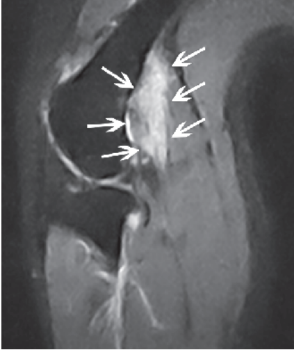
Figure 4 Short tau inversion recovery in sagittal orientation of the stifle of dog number 16. The proximal aspect of the gastrocnemius muscle shows a diffuse and well-defined severe hyperintensity (arrows).

on the lateral ridge of the femoral trochlea, were noted in three dogs.